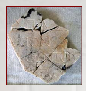
Piazza Nicola Amore.

The epigraphic team started working in the building yard and now goes on filing and copying the inscriptions in a shed outside the city.